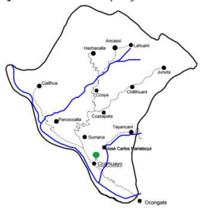
Figure 2 – Overview locations of villages within the Ccarhuayo district

agricultural production, animal husbandry is more market oriented and provides the largest part of the on-farm income (Kristjanson, 2007; Postigo, 2008). However, years of free-roaming have left large parts of the land in Ccarhuayo unproductive and degraded, making it harder to feed the animals and maintain healthy and large stocks. Currently, for most families only a small part of the total family income is generated by on-farm activities. Usually men have side-jobs during (parts of) the year in construction or mining and this is where relatively most money is made.