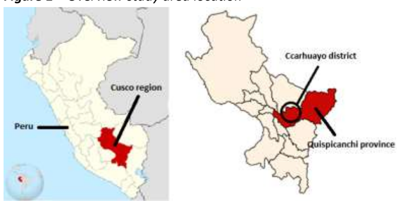
Figure 1 - Overview study area location

Possibilities for agricultural production are limited by the thin soils on hard rock material ( leptosol soils ) (Ministerio de Agricultura y Riego de Peru, 2015), elevation ranges between approximately 3000m and 5000m, sloping land and a lack of water. Instead, the land is most suitable for extensive livestock farming and forests (Raboin and Posner, 2012). Herding is an ancient tradition for Ccarhuayan people. Livestock species important to rural household's livelihoods include sheep, alpacas and guinea-pigs, and to a lesser extent cows, llamas, chicken and pigs. Households depend on their livestock for sources of income, protein, fertilizer and savings/insurance. Compared to